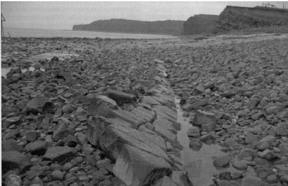
(Figure 4.9) Cliffs and shore platform at Kilve, Somerset