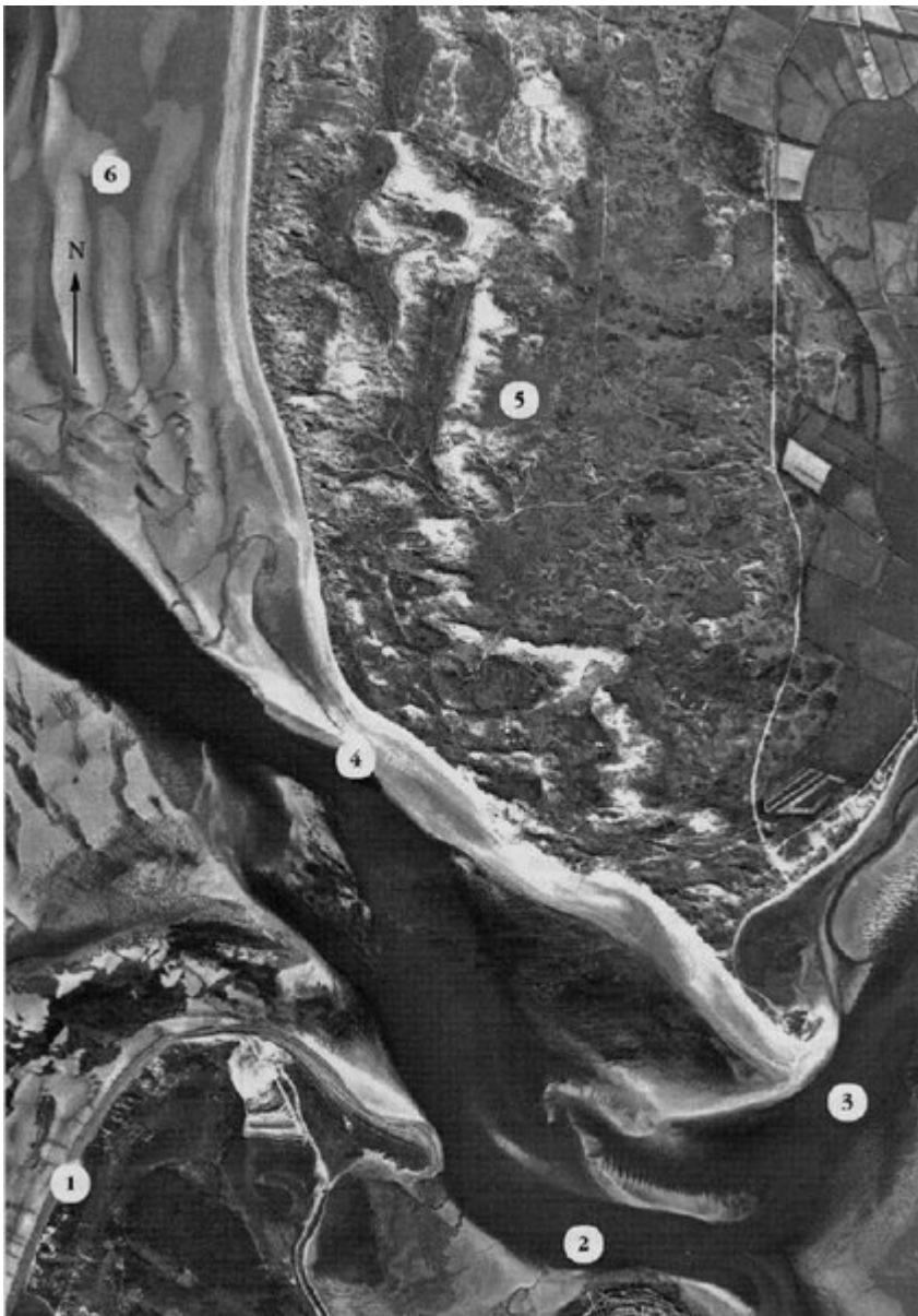
(Figure 7.9) Aerial photograph of dunes and Crow Point. 1, Westward Ho! cobble beach; 2, Taw-Torridge estuary; 3, Crow Point; 4, Airy Point; 5, Branton Burrows showing main dune ridges and blowthroughs; 6, ridge-and-runnel beach.