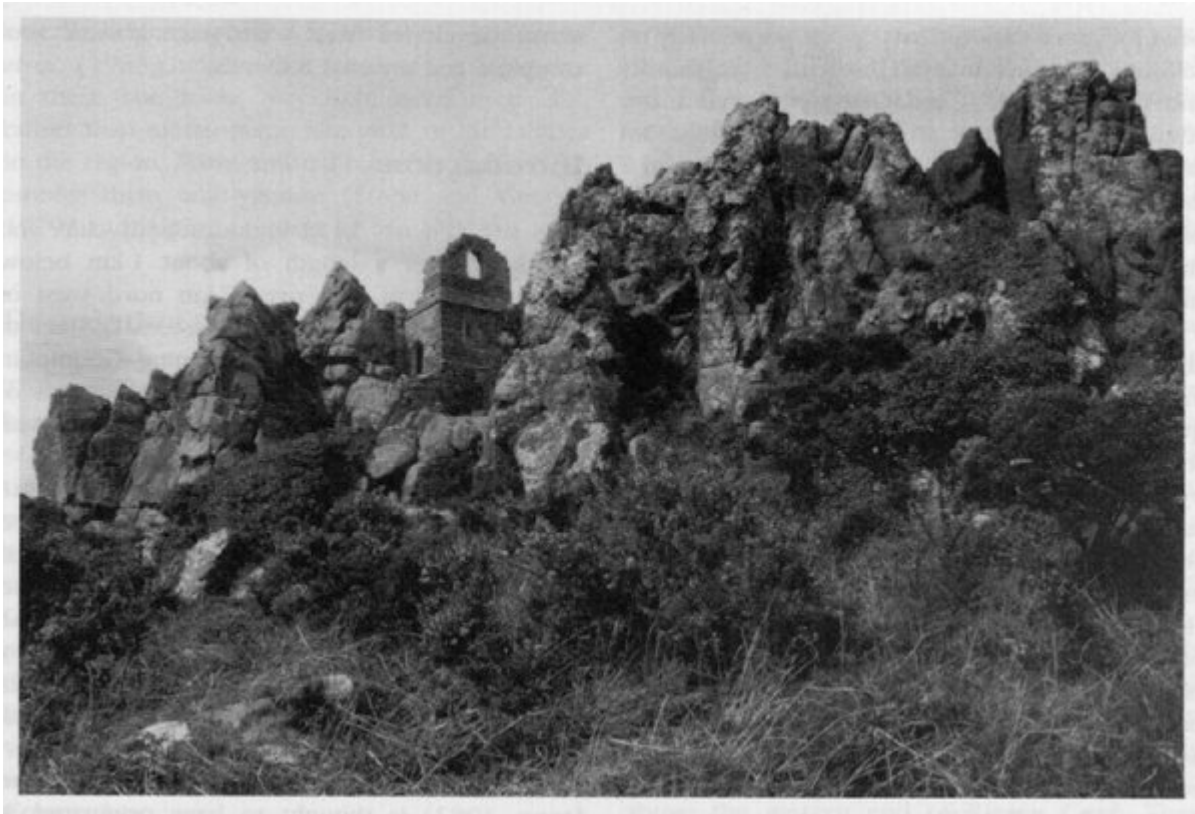
(Figure 5.17) The craggy outcrop of Roche Rock consists of quartz—tourmaline (schorl) rock. Roche Rock, Cornwall.