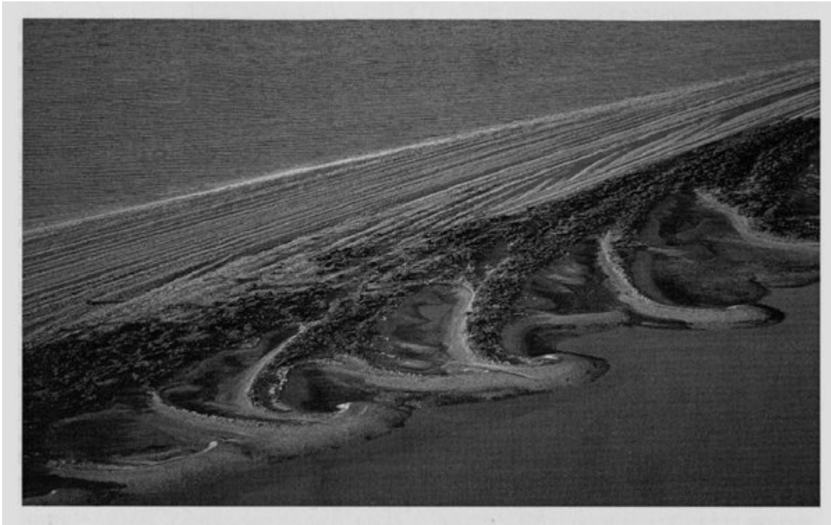
(Figure 11.5) Spectacular recurves extend from the active outer beach ridges at The Bar at Culbin into the sheltered area behind. The inner recurved parts of the gravel ridges support small areas of heather, gorse, broom and pine whereas the intertidal flats between the gravel ridges support small areas of saltmarsh (see Figure 11.4).