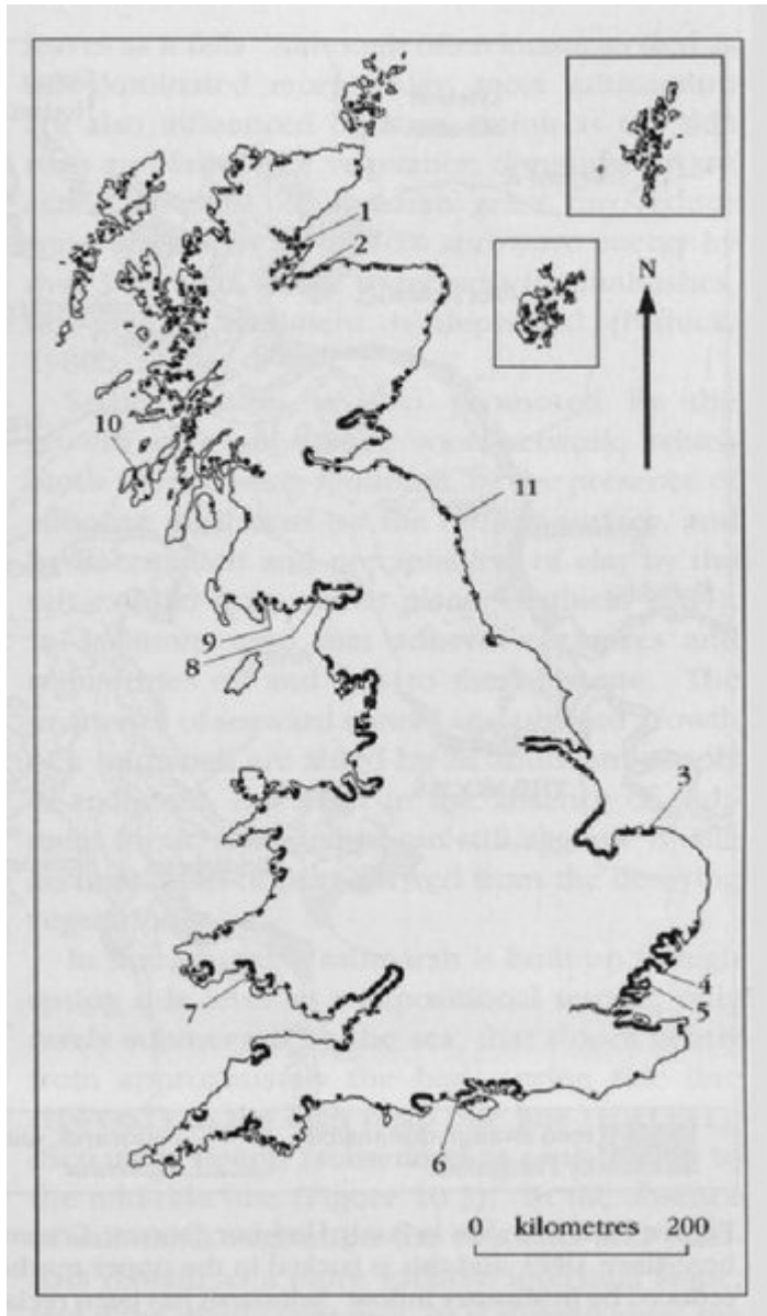
(Figure 10.1) The generalized distribution of active saltmarshes in Great Britain. Key to GCR sites described in the present chapter or Chapter 11 (coastal assemblage GCR sites): 1. Morrich More; 2. Culbin; 3. North Norfolk Coast; 4. St Osyth Marsh; 5. Dengie Marsh; 6. Keyhaven Marsh, Hurst Castle; 7. Burly Inlet, Carmarthen Bay; 8. Solway Firth, North and South shores; 9. Solway Firth, Cree Estuary; 10. Loch Gruinart, Islay, 11. Holy Island. (After Pye and French, 1993.)

The saltmarshes of Culbin are youthful, having largely developed in the last few hundred years. They display an intimate relationship to the shelter provided by the westward-moving gravel features of the outer coast. Westwards accretion is rapid, but proximal, erosion has led to foreshore exposures of immature saltmarsh peat.