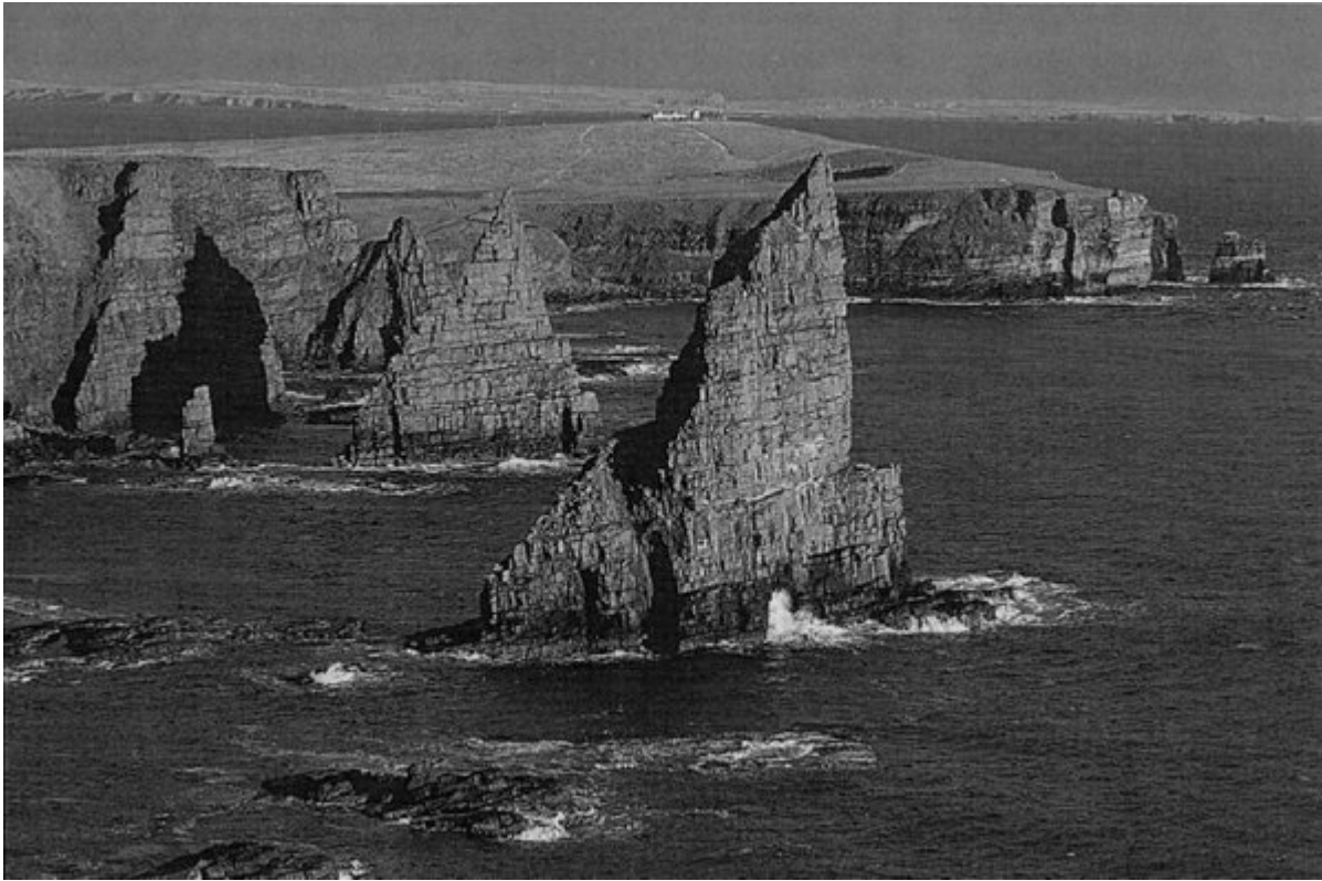
(Figure 3.15) The three large stacks of Duncansby stand in stark contrast to the otherwise bleak and smooth landscape of the north-east coast of Caithness. Looking north towards Duncansby Head and South Ronaldsay, Orkney, in the background.