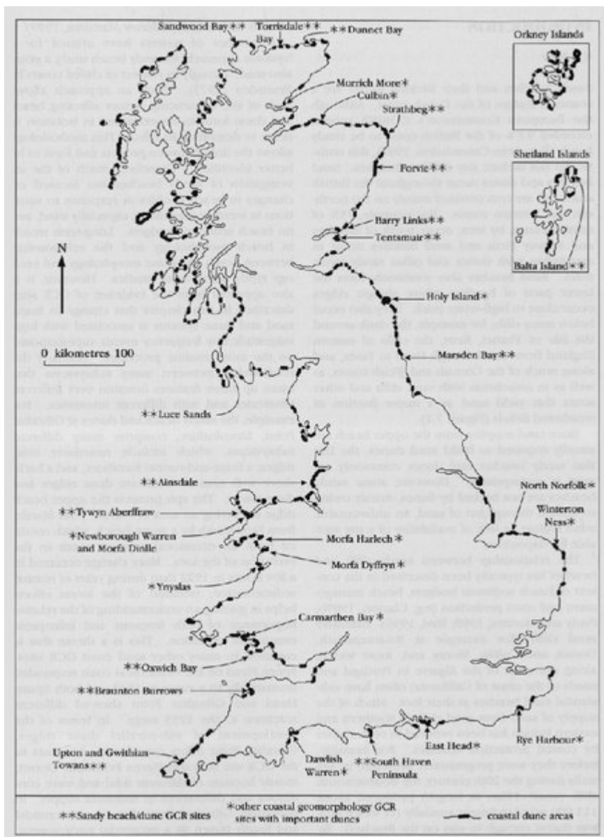
(Figure 7.1) Great Britain sandy beaches and coastal dunes, also indicating the location of GCR machair–dune sites (see chapter 9) and other coastal geomorphology GCR sites that contain dunes in the assemblage.