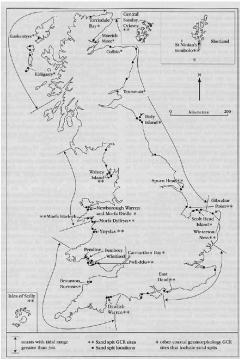
(Figure 8.2) The location of sand spits in Great Britain, also indicating other coastal geomorphology GCR sites that contain sand spits in the assemblage. (Modified after Pethick, 1984).