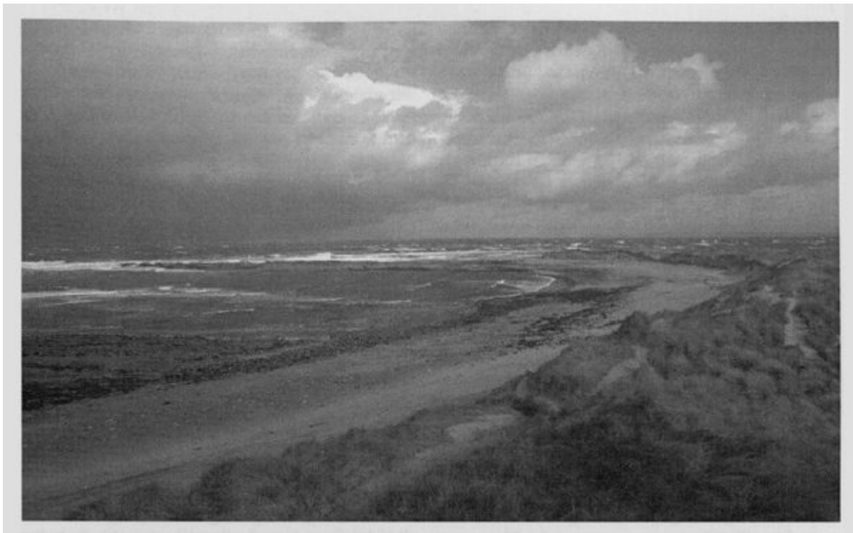
(Figure 11.26) Coves Haven, on the northern coast of Holy Island. The underlying Carboniferous Limestone is covered by till and emerged beach sediments, which are covered by dunes aligned from north-west to south-east.