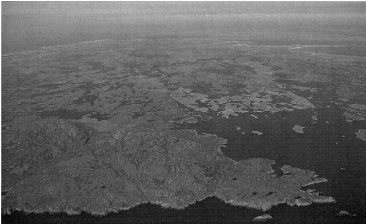
(Figure 3.17) The submerged landscape of North Uist looking north-west over Lochmaddy. Submergence of a low undulating rock surface has resulted in a landscape of low rock basins, platforms and skerries with a range of tidal and salinity conditions.