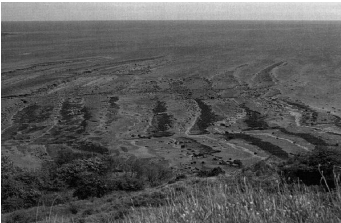
(Table 4.3) North Yorkshire coast cliff retreat rates in m a^{-1} (based on Agar, 1960).