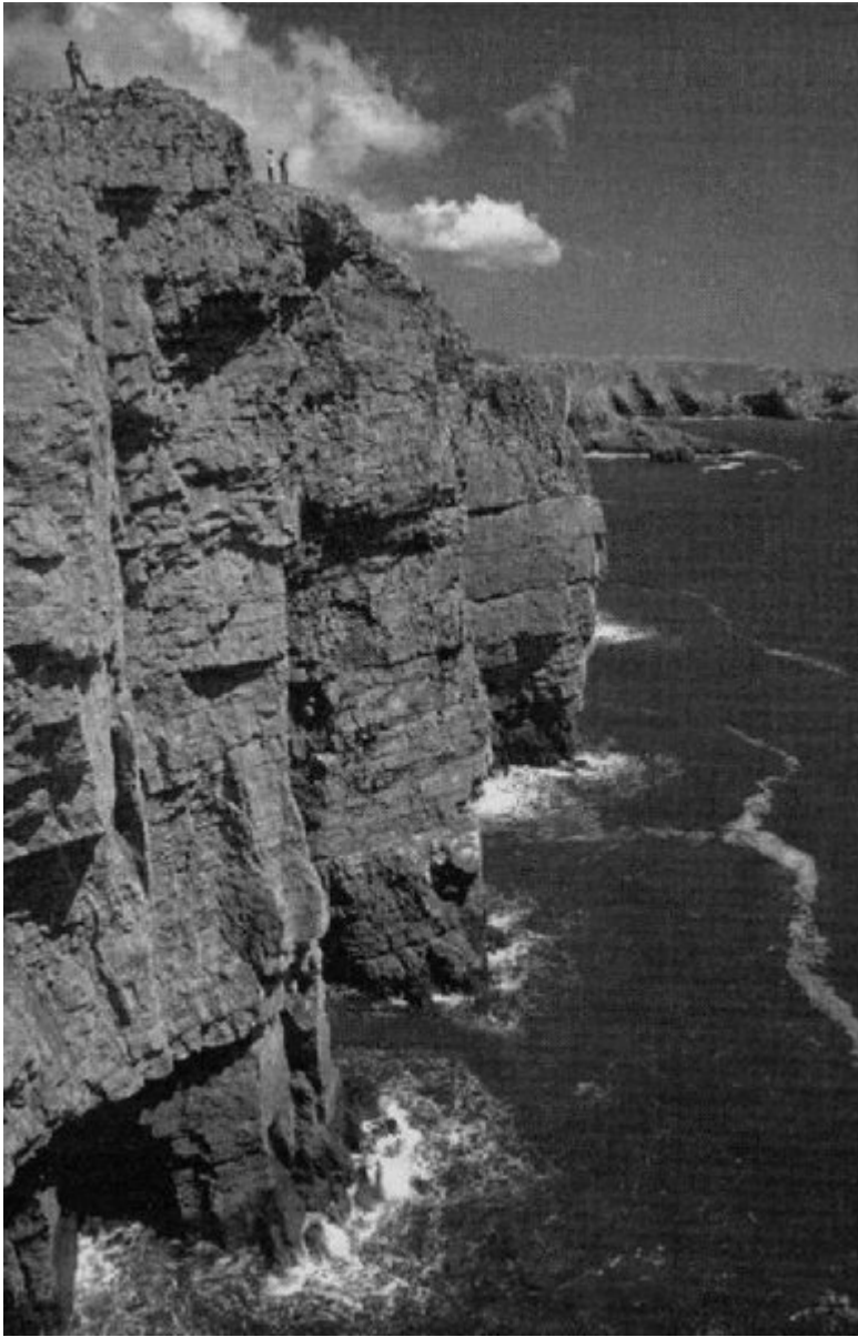
(Figure 3.30) Cliff profiles, South Pembroke Cliffs GCR site. Cliffs are steep, near-vertical and occasionally overhang where the dip is to landward.