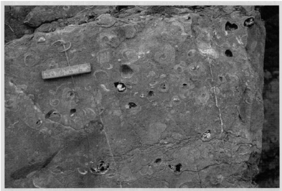
(Figure 9.27) Oncoids associated with Composita ficoidea in the Hunts Bay Oolite (Holkerian) at the Bracelet Bay GCR site.