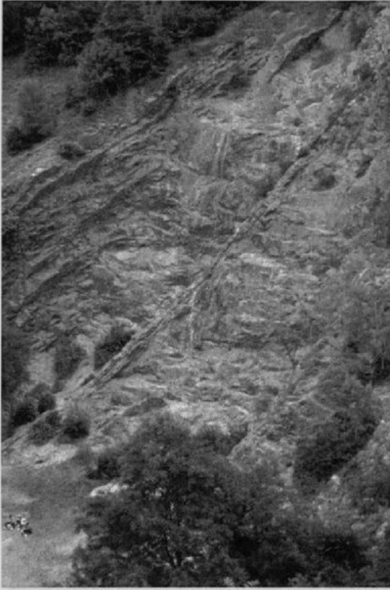
(Figure 9.40) General view of the upper part of the Burrington Oolite at Burrington Combe. A thin band crossing the centre of the figure (top right to bottom left) marks the position of the dolomitic 'Rib Mudstone' and the Arundian–Holkerian boundary (see text for further details).