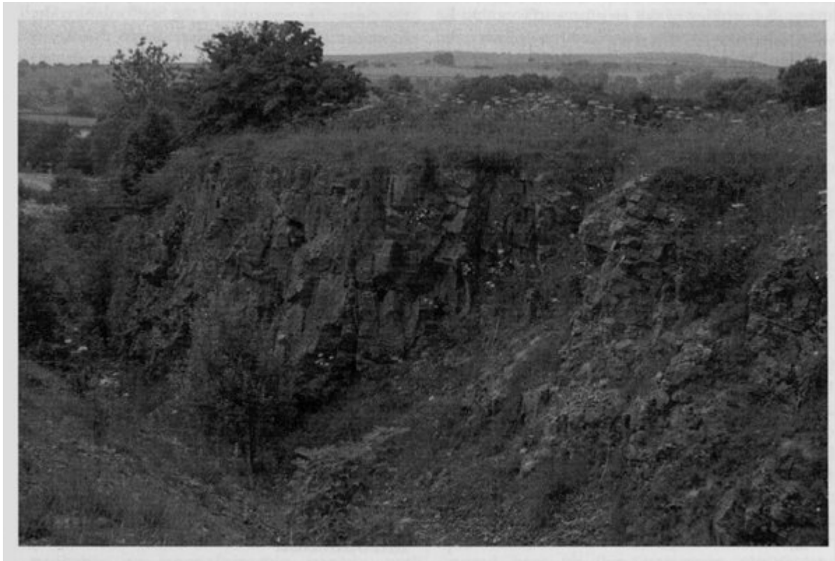
(Figure 7.30) General view of the Caldon Low Conglomerate (lower half of cliff face) in the Hopedale Limestones at Caldon Low Quarry. The height of the cliff is approximately 6 m.