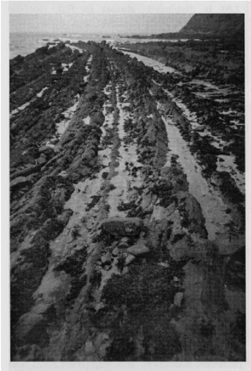
(Figure 2.7) Outcrops of the lower part of the Cove Harbour Member (Aberlady Formation) east of Cove Harbour. The topmost beds of the underlying Heathery Heugh Sandstone Member (Gullane Formation) can be seen in the near cliffs to the right. The large block (lower centre) is approximately 0.8 m long.