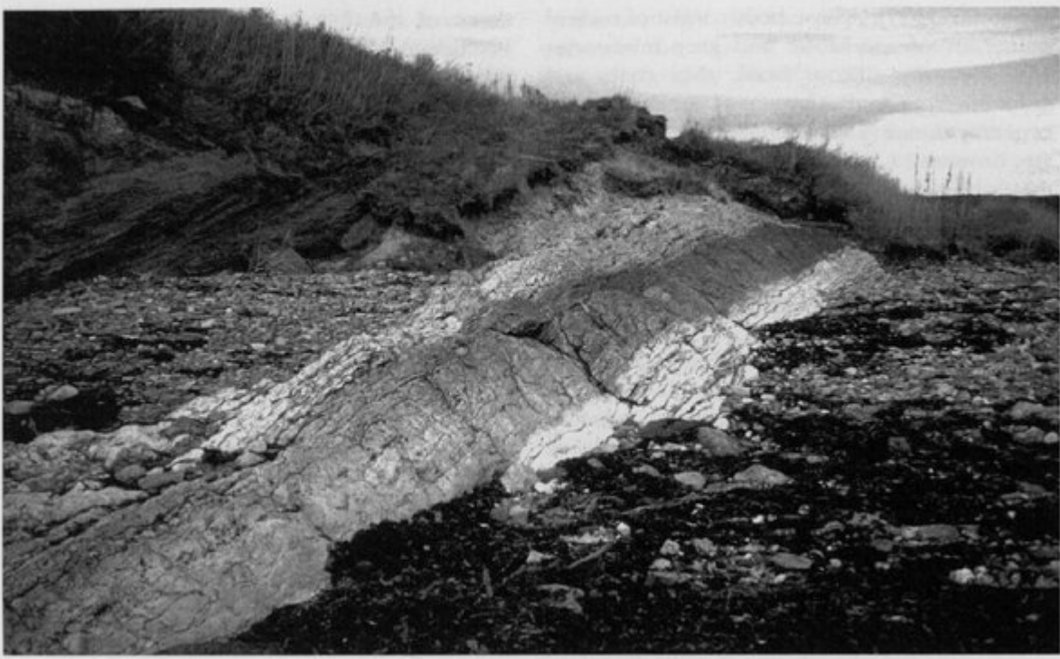
(Figure 2.13) Dolomitization of the St Monance White Limestone (Pathhead Formation, Strathclyde Group, Brigantian) close to St Monance, at the Elie–Anstruther GCR site, showing zone of dolomitization (darker band) between two paler developments of thinly bedded limestone with shale partings.