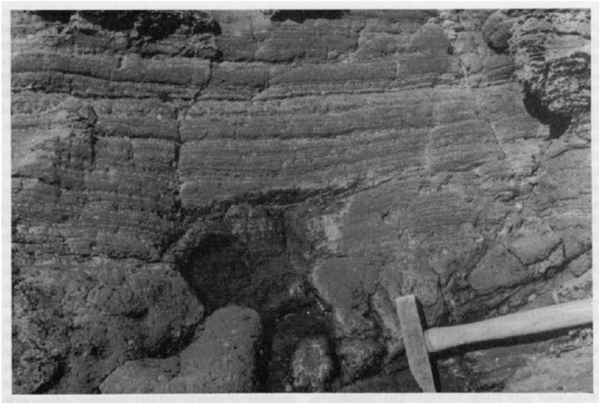
(Figure 6.4) Flow-banded rhyolite lava of Permian age that may have formed part of the volcanic field developed above the Cornubian granite batholith. Kingsand, Devon.