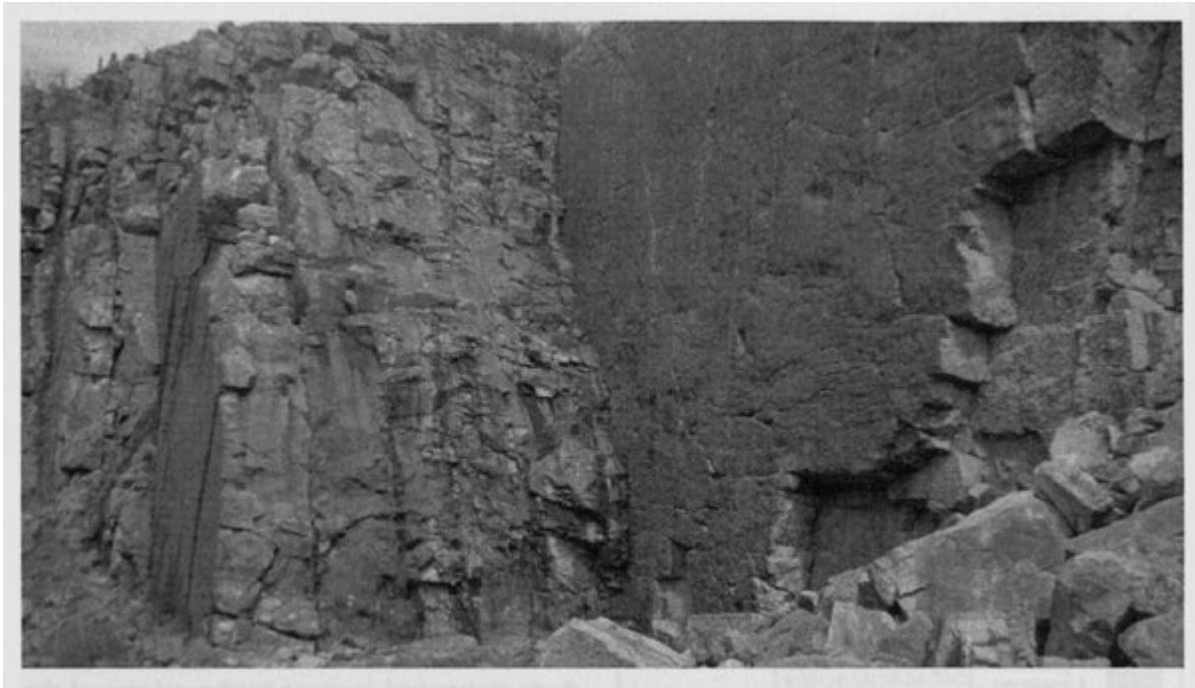
(Figure 4.11) Section of the Upper Urswick Limestone (Asbian) at Trowbarrow Quarry. Note the pseudo-brecciated appearance (possible bioturbation mottling) of bedding plane surfaces seen to the right of the illustration. The younging direction ('way up' of the sequence) is also to the right (to the east). The height of the quarry face is approximately 20 m.