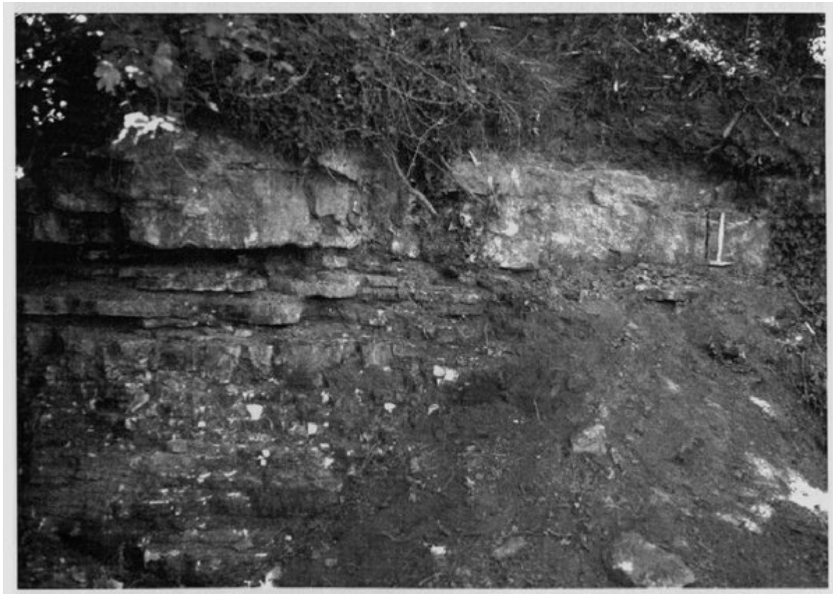
(Figure 3.15) The section at Bowdish Quarry, Radstock. The thick limestone towards the top is the Bucklandi Bed, overlain by the Spiriferina Bed and Turner's Clay. The lower part of the face is of more thinly bedded limestones and mudstones of the Planorbis Zone.