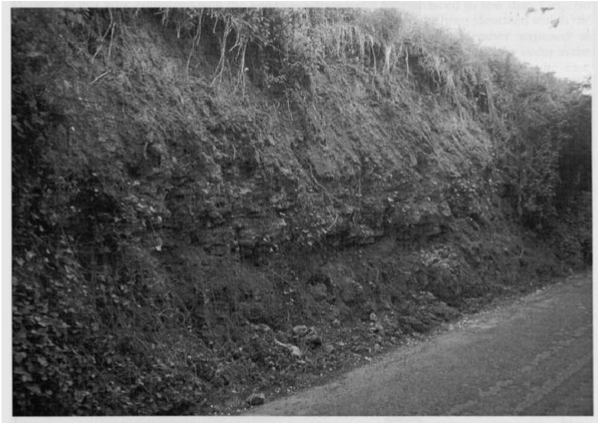
(Figure 2.22) Landslip exposing the Barrington Limestone Member of the Beacon Limestone Formation on the east side of Hurcott Lane. The conspicuous notch is at about the level of beds 11–13.