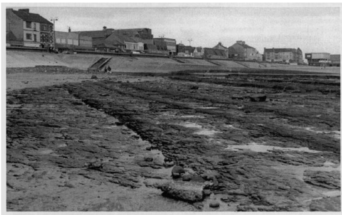
(Figure 6.4) Redcar foreshore after storms have washed away the beach sand, exposing mudrocks of the Redcar Mudstone Formation, Calcareous Shale Member. This area exposes part of the 'Upper Bucklandi Beds' of Tate and Blake (1876), of Scipionium Subzone to Sauzeanum Subzone age.