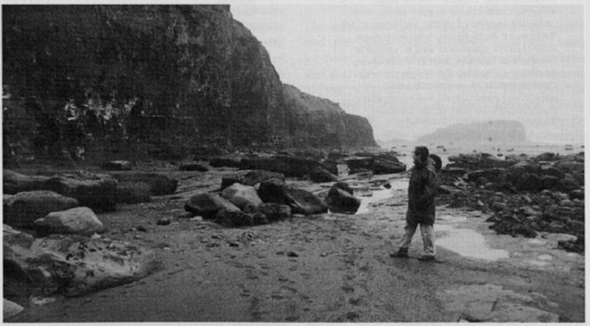
(Figure 6.22) The Whitby Mudstone Formation in the cliffs at its type location.