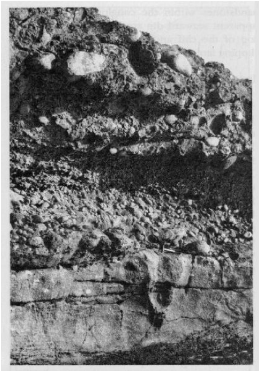
(Figure 3.15) Coarse conglomerates of the Crawton Volcanic Formation resting on the eroded top of the third lava.