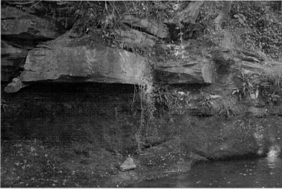
(Figure 5.15) Distributary channel sandstone body in the Raglan Mudstone Formation at Cusop Mill fall [SO 239 413]. Fining-upward tabular and trough-cross-stratified beds overlie a scoured surface cut in parallel-bedded fine-grained sandstones that conformably overlie siltstones. The coarser sandstones are more resistant and cap a waterfall.