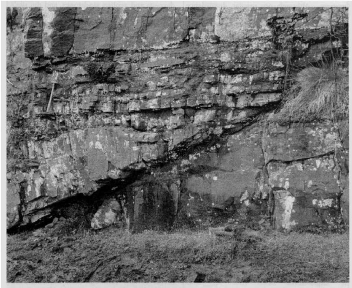
(Figure 5.37) South face of Blaen Duffryn Cawnon [SO 0936 1507]. Sandstones and siltstones fill a channel in the upper part of the Plateau Beds Formation. Brachiopods are present in the channel-fill.