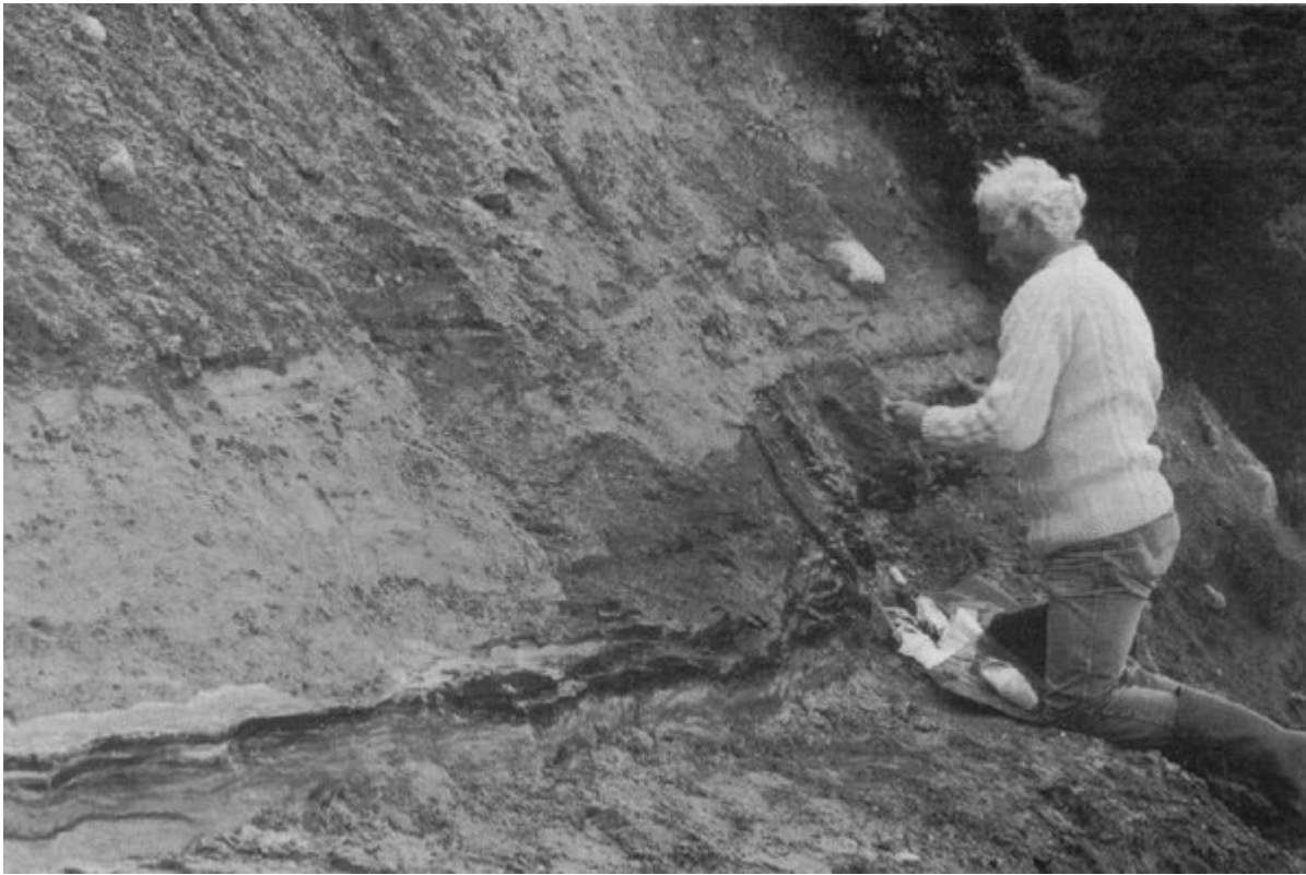
(Figure 7.6) Section at Allt Odhar showing the Odhar Peat resting on the Odhar Gravel and overlain by the Paraglacial Member of the Moy Formation.