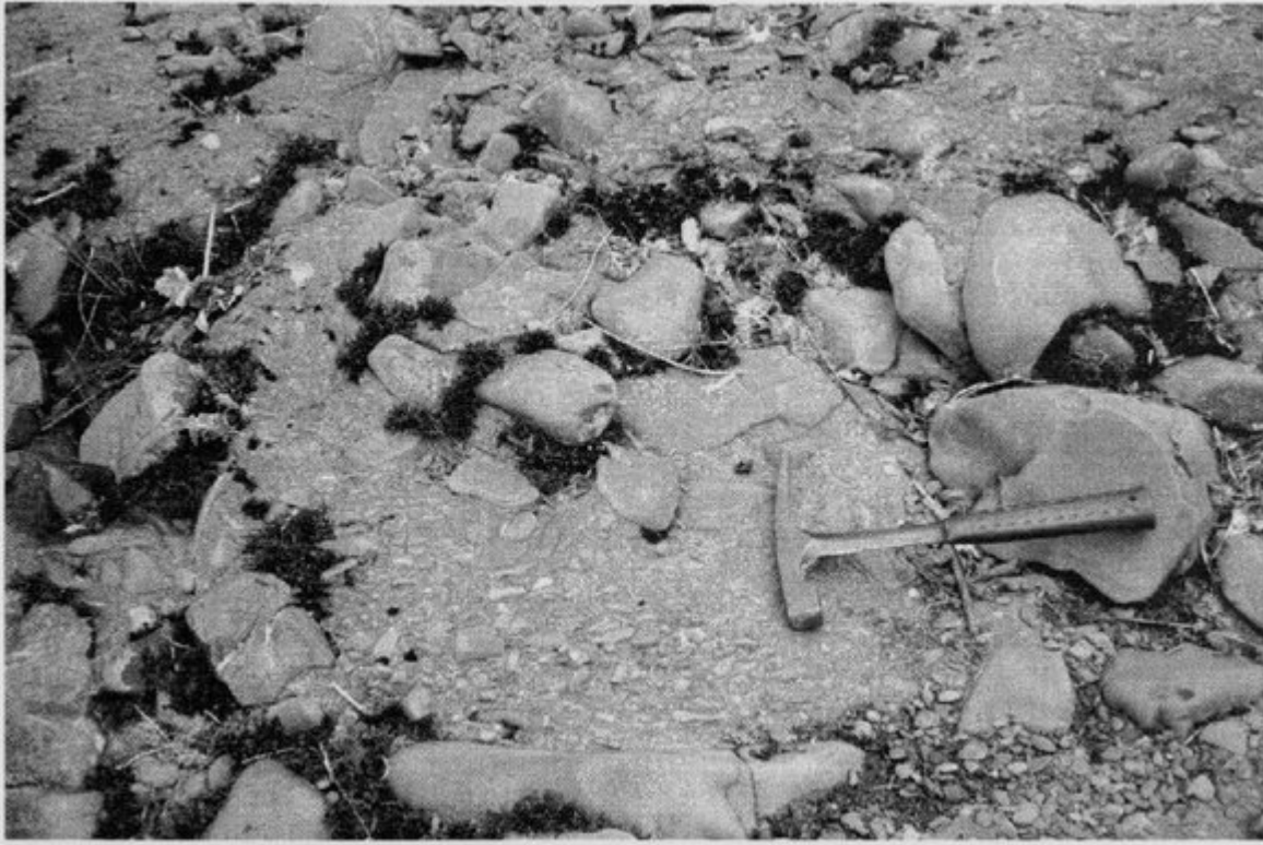
(Figure 4.6) Conglomerate of the Mell Fell Conglomerate Formation on the shore of Ullswater near Pooley Bridge.