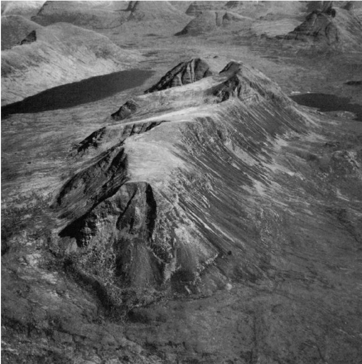
(Figure 6.10) Protalus rampart on the north-west flank of Baosbheinn. The view also shows the rock avalanche scar, the two lower Wester Ross Readvance moraine ridges and a Loch Lomond Readvance moraine intersecting the latter at the base of the mountain.