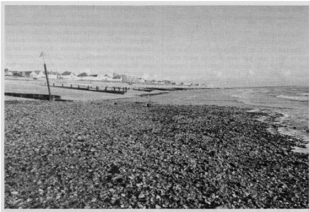
(Figure 4.12) General view of the Lee-on-the-Solent GCR site, which provides foreshore exposures of Middle Eocene sediments, one of the very few Middle Eocene fossil bird localities.