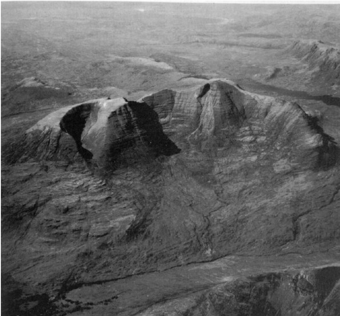
(Figure 6.11) Geomorphology of Toll a'Mhadaidh, Beinn Alligin, showing rockslide debris and principal glacial landforms (from Sissons, 1977d). formation, as they take the form of proglacial lobes (see Wahrhaftig and Cox, 1959; Liestøl, 1961; Outcalt and Benedict, 1965; White, 1976; Lindner and Marks, 1985; Martin and Whalley, 1987; Whalley and Martin, 1992) that have apparently developed as a result of deformation of ice within rockfall talus accumulations. The only other features in Britain that may be of similar origin to that at Beinn Alligin are at Moelwyn Mawr in North Wales (Campbell and Bowen, 1989) and Beinn an Lochain in Argyll (Holmes, 1984; Maclean, 1991).