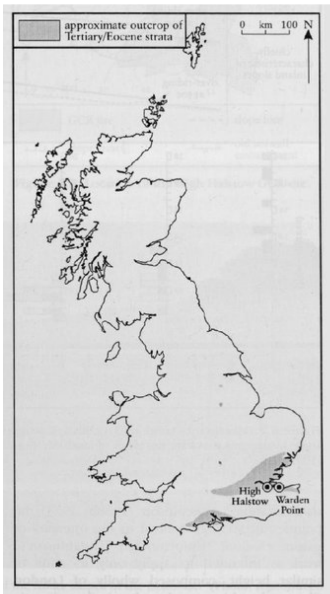
(Figure 8.1) Areas of London Clay (Eocene) strata (shaded) and the locations of the GCR sites described in the present chapter.