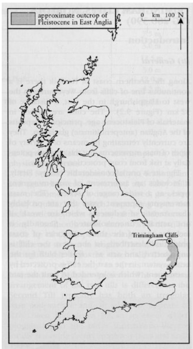
(Figure 9.1) Areas of Pleistocene strata in East Anglia (shaded) and the location of the Trimingham Cliffs GCR site, described in the present chapter.