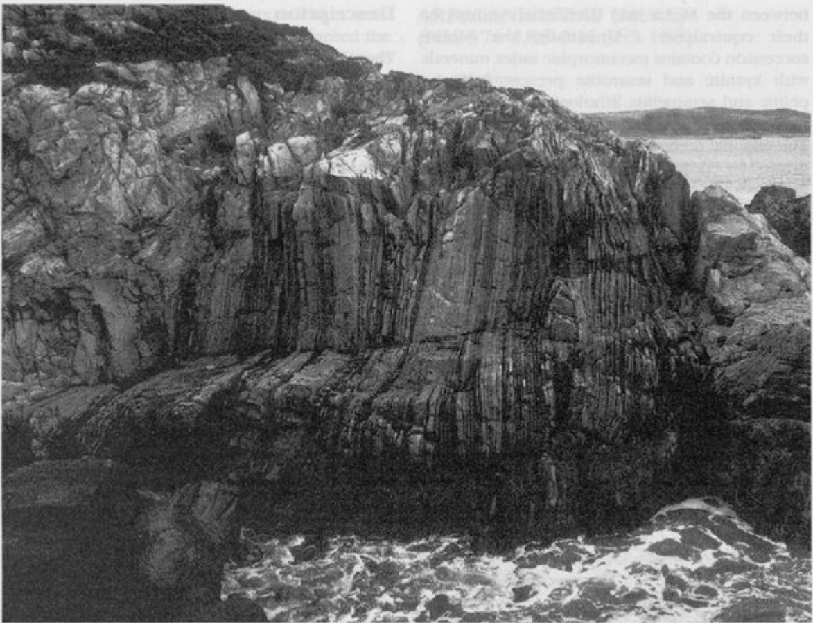
(Figure 8.30) Highly strained and hornfelsed rocks of the Ardalanish Striped and Banded Formation at the eastern contact of the Ross of Mull Pluton, cut by veins of the contaminated marginal granite variant. A' Bhualaidh looking NNE.