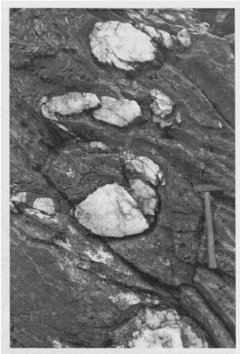
(Figure 6.7) Rodded, folded and segregated, originally discordant quartz veins in pebbly and gritty psammites of the A' Mhoine Psammite Formation. Ben Hutig, 100 m south-west of the summit. The hammer is 37 cm long.