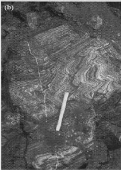
(Figure 9.13) Typical blastomylonites of the Hascosay Slide Zone on the Ness of Cullivoe. (a) 'Banded blastomylonite' with hornblende and biotite [HP 551 022]. The lens cap is 7 cm in diameter. 1 (b) Folded blastomylonites [HP 548 028]. The hammer is 40 cm long.