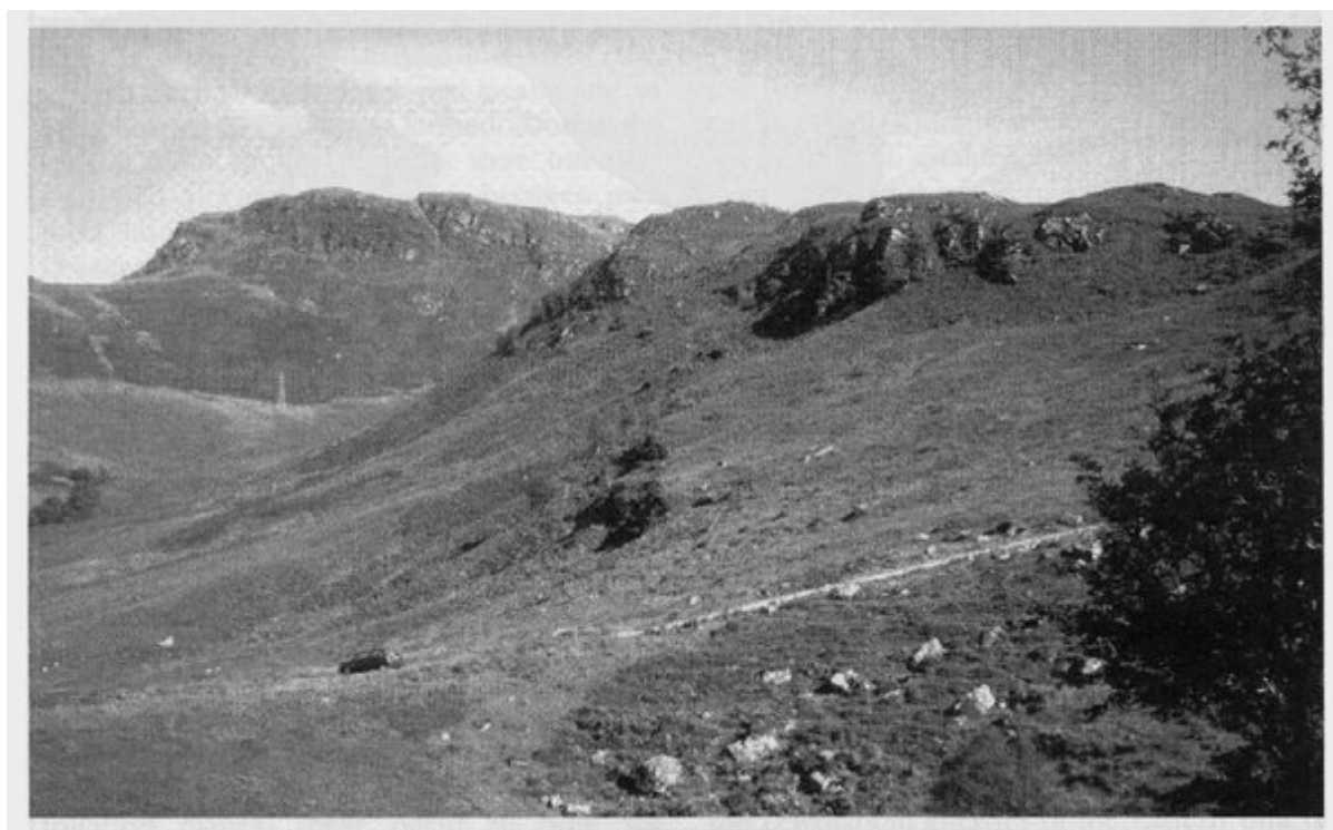
(Figure 7.25) View of Druum Iosal from Dun Grugaig, Gleann Beag. The crags in the centre are composed of garnetiferous kyanite-biotite gneiss.