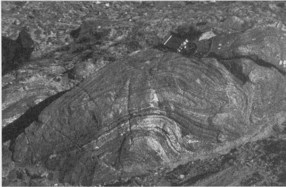
(Figure 6.28) Tight F2 folds refolded by more-open F3 folds giving a type-3 interference structure. Top of sandy scree slope, Farr Bay, at [NC 7159 6272]. The compass is 18 cm long.