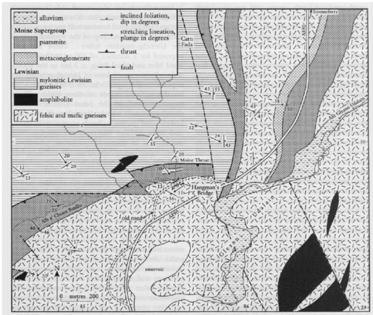
(Figure 5.56) Map of the area around the Hangman's Bridge GCR site. The location of this figure is shown on Figure 5.52.