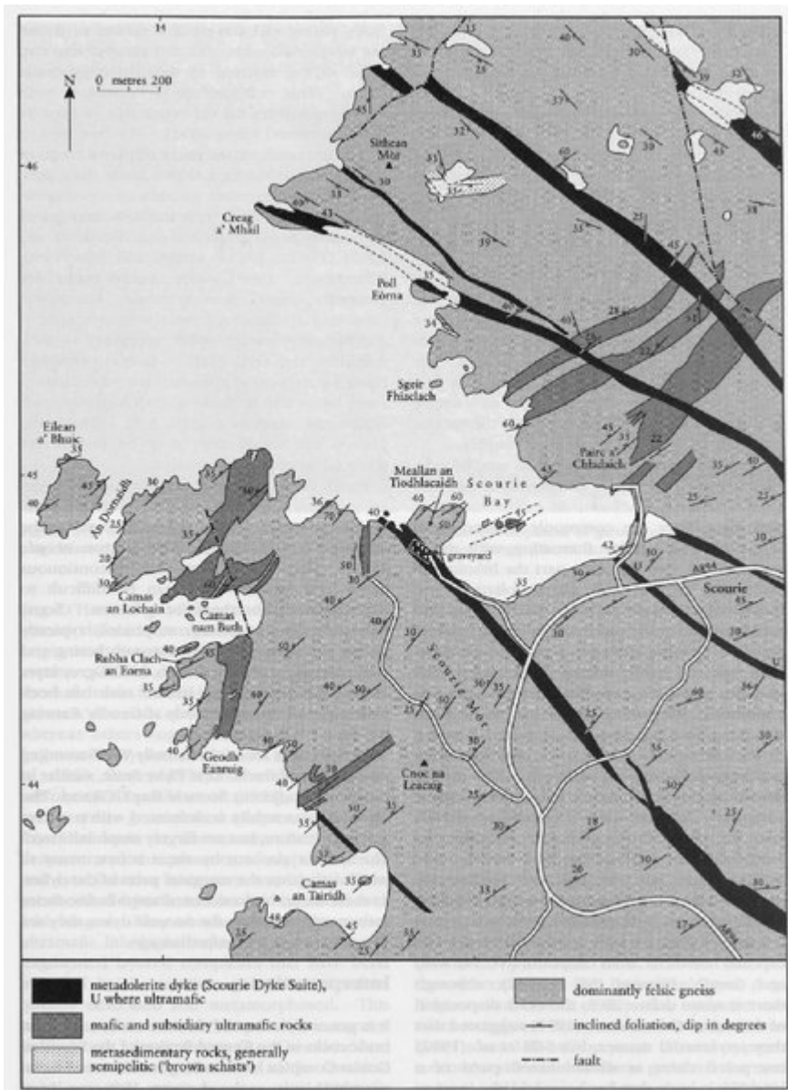
(Figure 3.4) Map of the Scourie area, including the areas covered by the Scourie Mor, Scourie Bay and Sithean Mòr GCR sites. Based on the Geological Survey 1:10 560 sheets Sutherland 30 (1913), 39 (1912), and O'Hara (1961a).