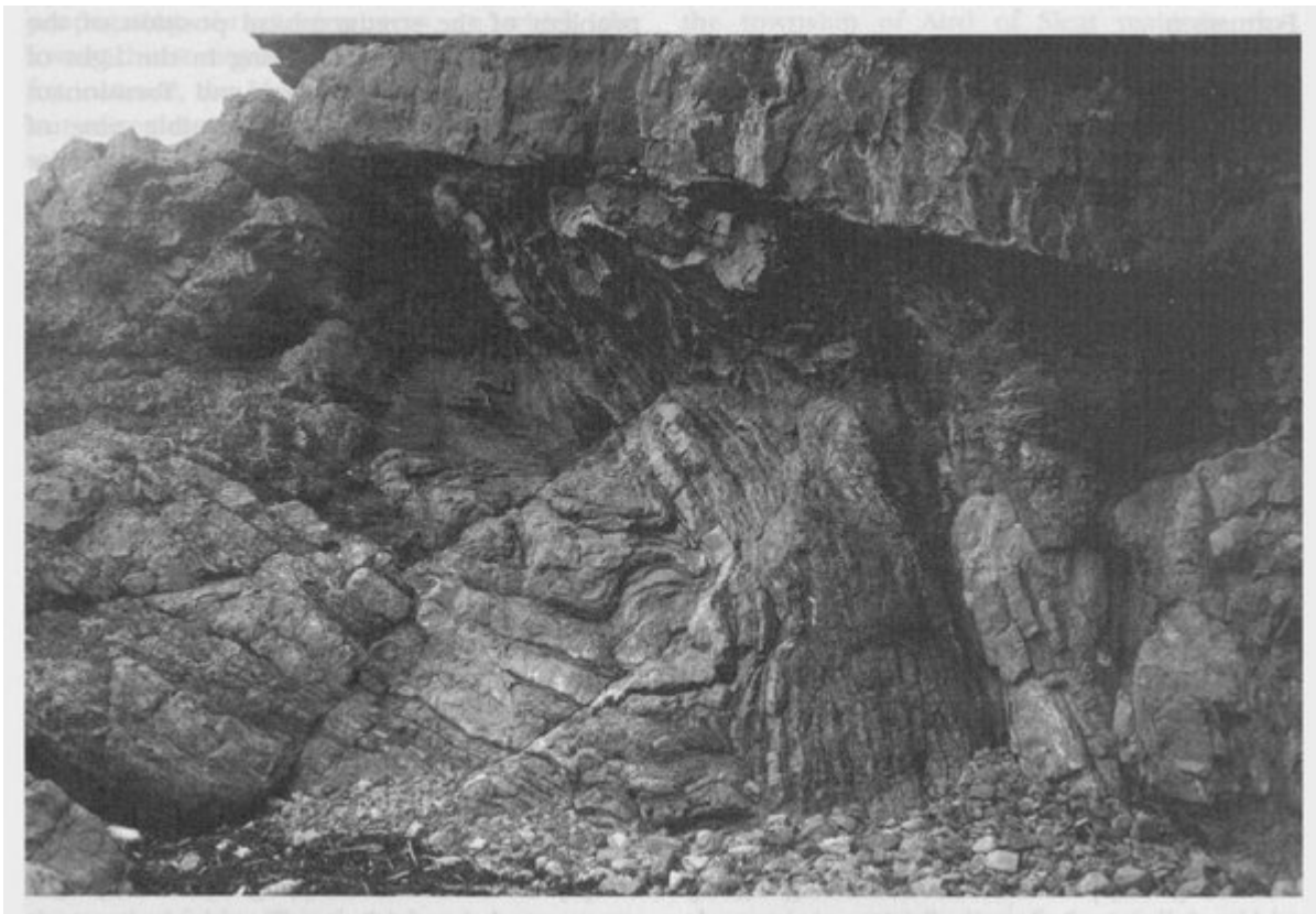
(Figure 5.62) The Tarskavaig Thrust at the south side of Tarskavaig Bay. Tarskavaig Moine rocks lie above the thrust with folded Torridonian Sleaf Group rocks below.