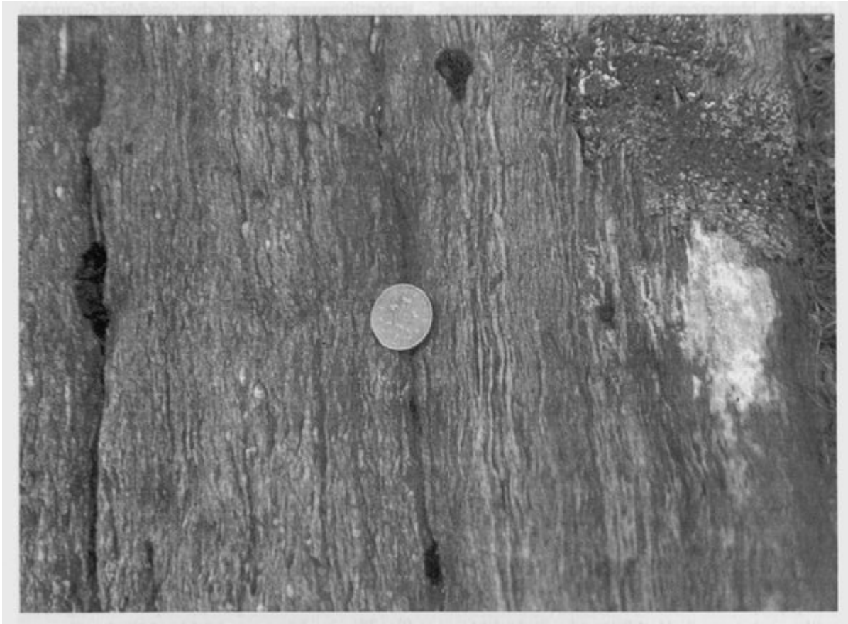
(Figure 9.5) Rocks of the Wester Keolka Shear Zone at [HU 3560 9191] on the south side of the entrance to Sand Voe, North Roe. The coin lies over the shear plane and is 2.5 cm in diameter.