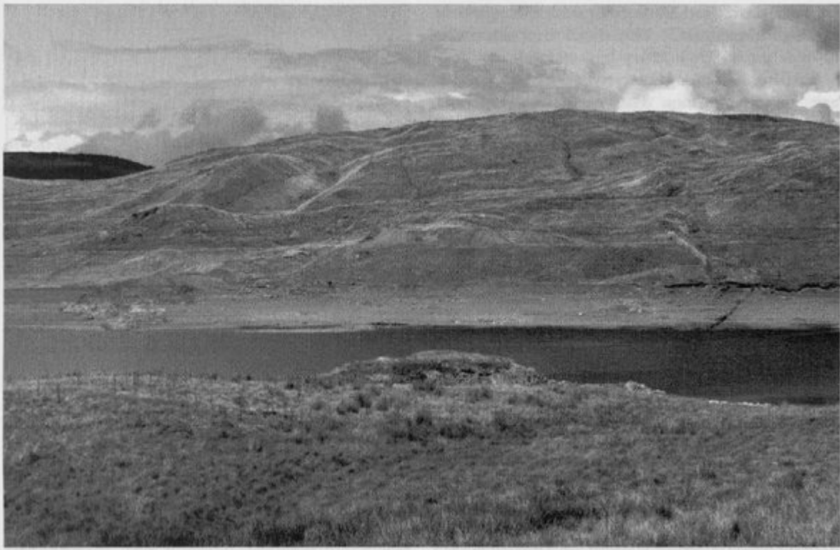
(Figure 5.56) Photograph of the Brynyrafr Mine GCR site.