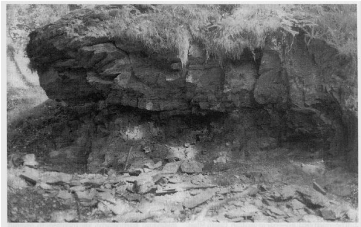
(Figure 5.38) Photograph of the Cae Coch Mine GCR site, showing the top open-pit.