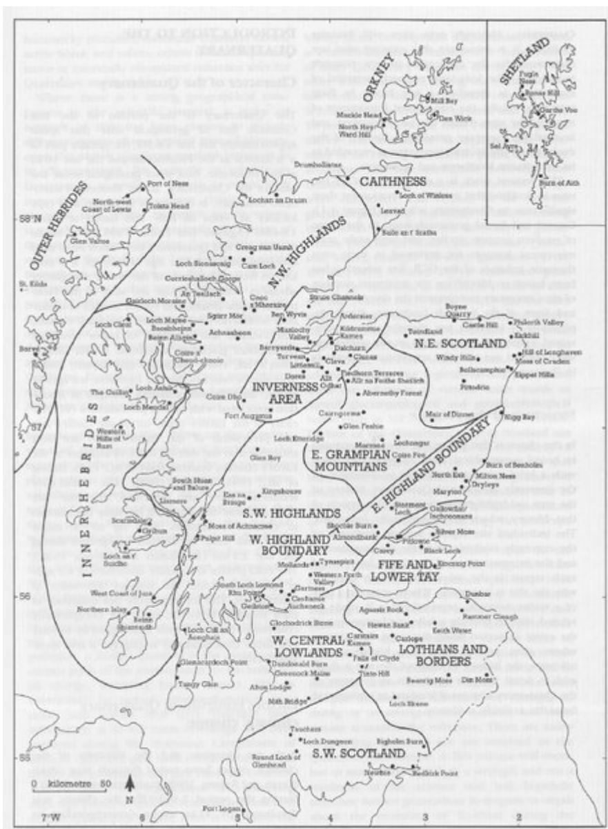
(Figure 1.1) Location of sites and areas described.