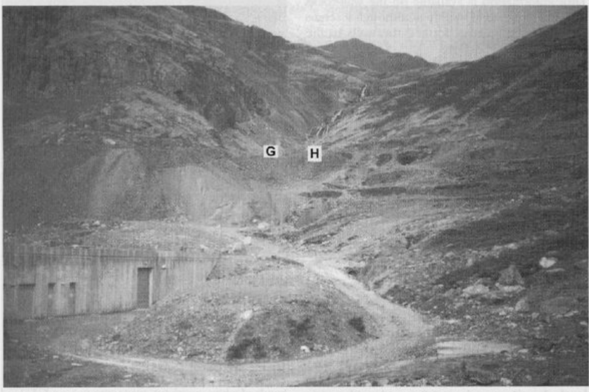
(Figure 2.8) View of the Paddy End workings at Coniston Copper Mines. The large dumps in the foreground adjoin Hospital (H) and Grey Crag (G) levels. Dumps from higher levels may be seen to the left of the stream. Ancient surface workings, including Simon's Nick, are visible on the skyline above these dumps. The modern buildings are part of a water-treatment plant.