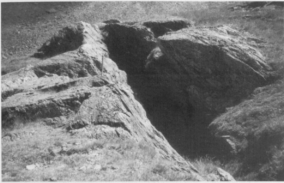
(Figure 2.11) Dale Head North and South Veins. Old opencast working in the North Vein, here between strongly cleaved Skiddaw Group wall-rocks.