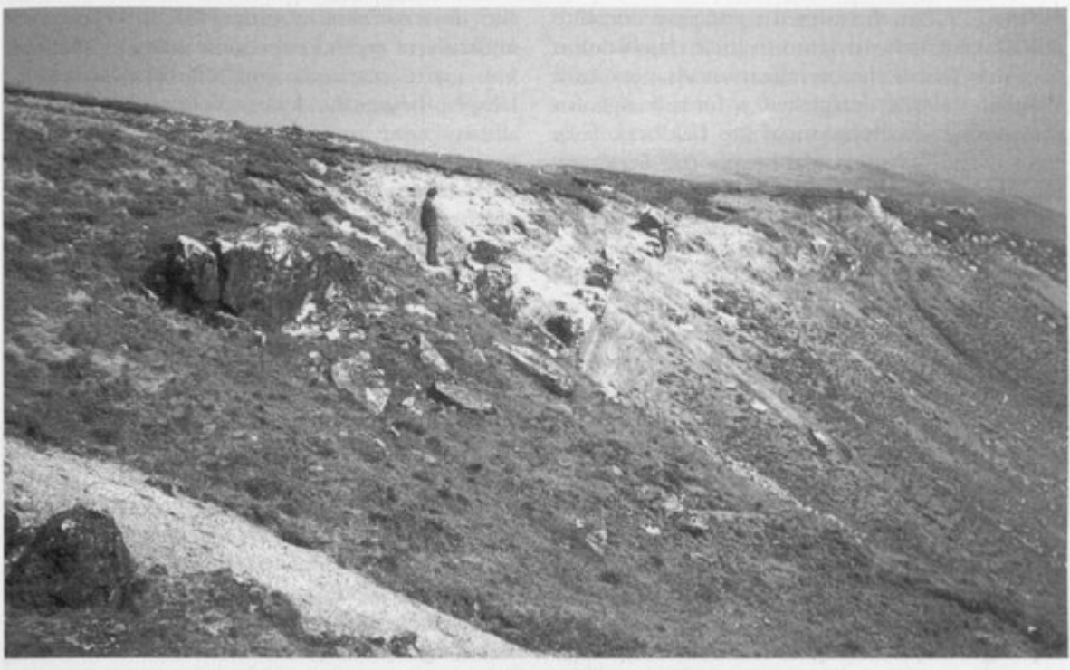
(Figure 2.20) Dry Gill Mine. View eastwards along Dry Gill Vein which here crops out as a prominent quartz-rib on the north side of Dry Gill.