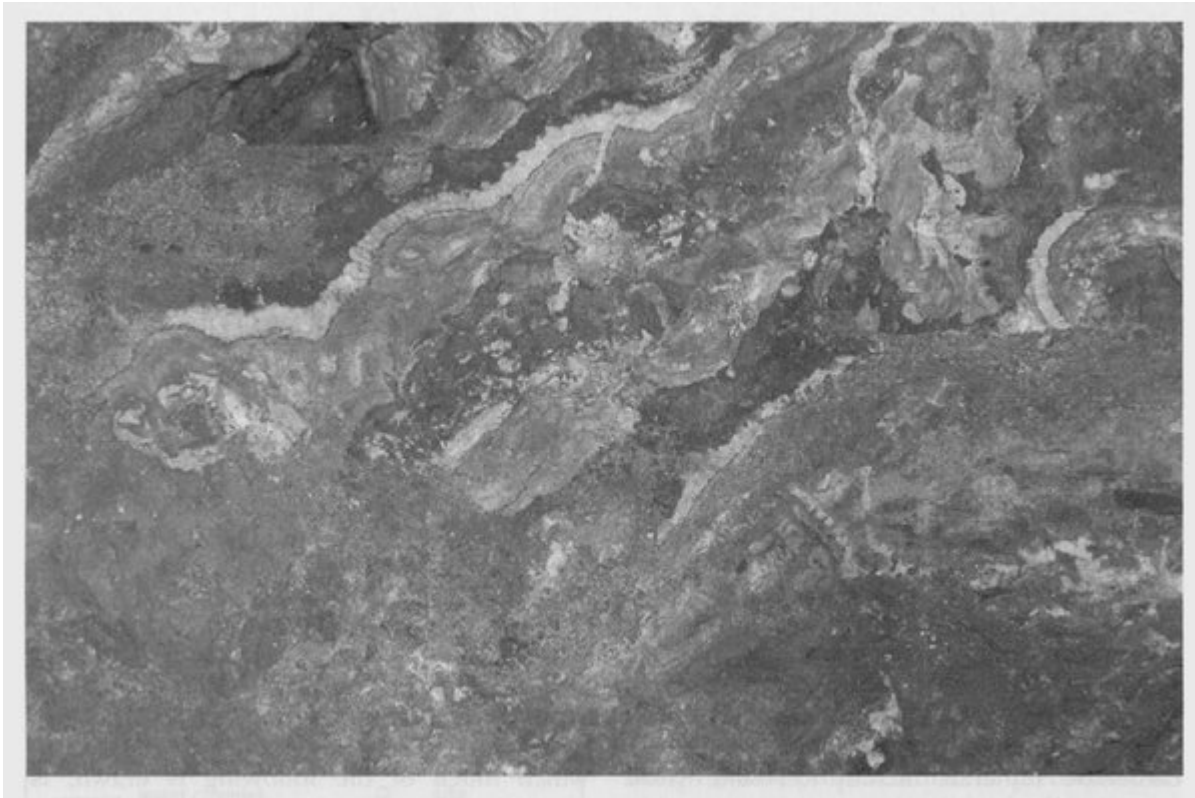
(Figure 4.29) The remains of mineralization within Clayton Mine.