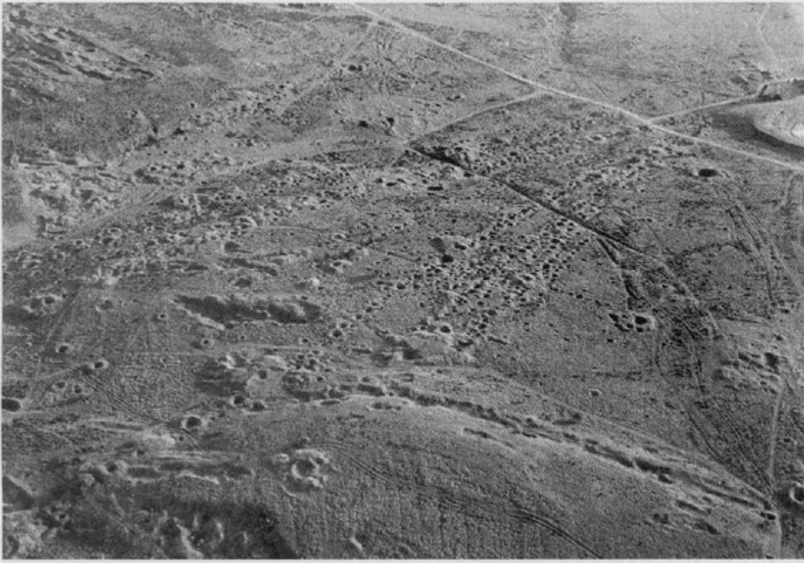
(Figure 5.73) Oblique aerial photograph of old lead workings at the Halkyn Mountain GCR site.