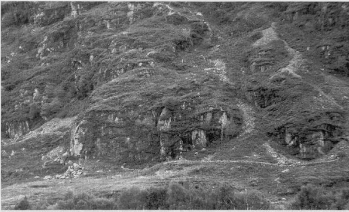
(Figure 5.32) Photograph of the Llyn Cwellyn Mine GCR site.